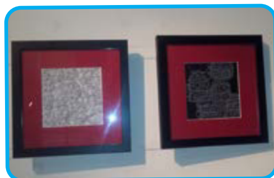
Image description: Two abstract line artworks in black frames with red mats.

We can't wait to see what James creates next!